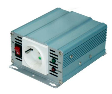
Model: Inverter 350W-12 Inverter 350W-24